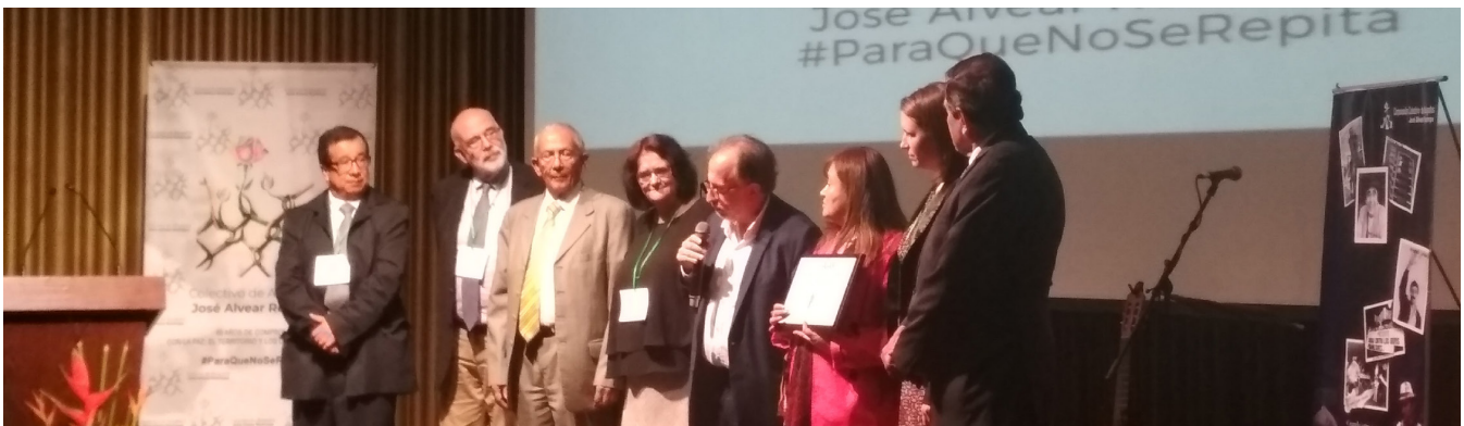
Caravana delegates from the UK and Spain presenting an award in recognition of 40 years of CCAJAR at their anniversary celebrations, in Bogota

Delegates heard how lawyers across the country deem international monitoring and solidarity of great importance to encourage the government to take meaningful action to ensure the safety of human rights defenders. The International Caravana coincided with the 40th anniversary celebrations of CCAJAR. CCAJAR members reiterated the importance of the international community's support. When a delegate asked a senior lawyer of CCAJAR how he could tell the work of the International Caravana and the wider global community is effective he said "the proof is that I am still alive, which probably would not be the case without the Caravana." 78