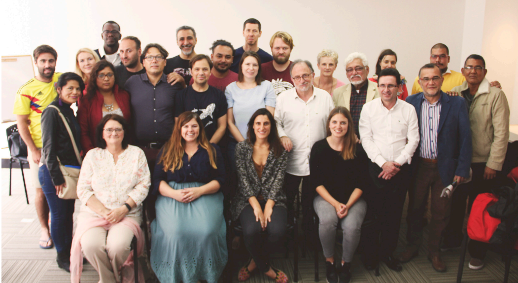
Delegates with Colombian lawyers at the closing session of the International Caravana in Bogota

The International Caravana of Jurists is the embodiment of the international legal community's concern and solidarity with human rights lawyers and other human rights defenders in Colombia.