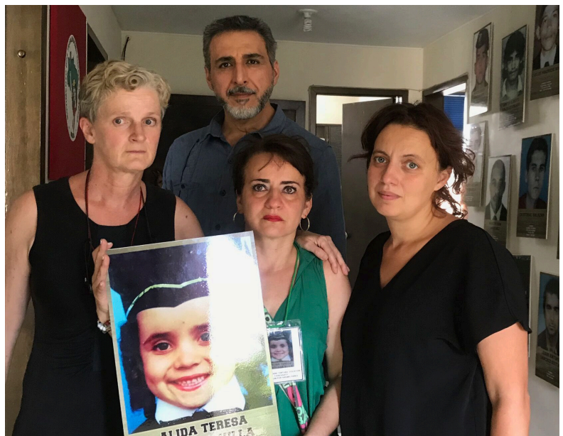
Family member of victim holds a photo of their loved one, alongside delegates.

Concerns were raised to the Caravana about the availability of resources for victims who need to travel long distances to participate in the process. This should be carefully considered when looking at budgets, resources, and the implementation of JEP processes.