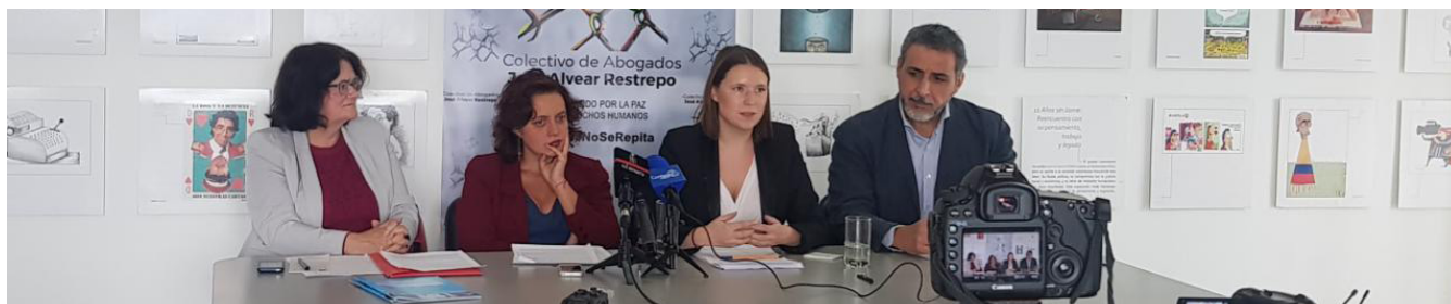
Delegates from the UK, Italy, and Mexico present initial findings at a press conference in Bogotá, on their return from visiting six regions of Colombia

The situation of human rights defenders and people's ability to exercise the fundamental freedoms of expression and assembly has been further impacted by the criminalisation of protest with changes to the police code and protocols on protest. It has been suggested that these changes aim to restrict protest 57 by social movements. Delegates understand that serious criminal charges are being used in an attempt to deter protesters, for example, some of the charges levied against protesters carry up to 28 years imprisonment.