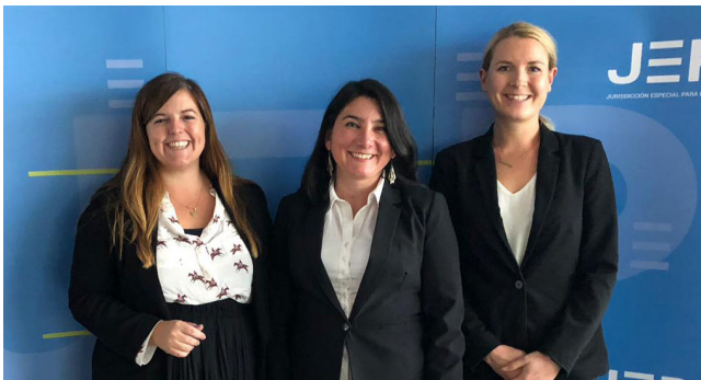
Delegates meeting with Judge Tania Bolaños, deputy to Patricia Linares, President of Special Jurisdiction for Peace (JEP)

The availability of amnesties is limited to those who have committed political crimes during, and in relation to, the conflict. Political crimes are defined as crimes of riot, rebellion, and sedition (examples given include, espionage, interception of communications, false document offences, misuse of uniforms and insignias, production and storage of weapons). War crimes, crimes against humanity, and genocide are all excluded from the amnesty provisions, as are crimes committed for economic gain. 25 In order to be eligible for amnesties an individual must make a commitment not to return to illegal armed activities. The Chamber for Amnesties and Pardons can also require that an individual participate in restorative activities and cooperate with the Truth Commission and/or the National Commission for the Search for Disappeared Persons.