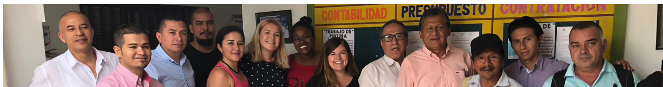
Delegates meeting with victims, indigenous and community leaders, FARC ex-combatants, COCCAM, human rights ombudsman, human rights lawyers and defenders, in the Palacio Municipal, Miranda, Valle del Cauca