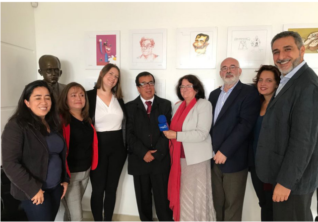
Lawyers from CCAJAR with delegates and the press in Bogotá

Despite the signing of the Peace Agreement with the FARC, a number of other illegal armed groups remain active in Colombia, such as the National Liberation Army ( Ejército de Liberación Nacional - ELN), Popular Liberation Army ( Ejército Popular de Liberación - EPL) and Gaitanista Self-defence Forces of Colombia ( Autodefensas Gaitanistas de Colombia ).