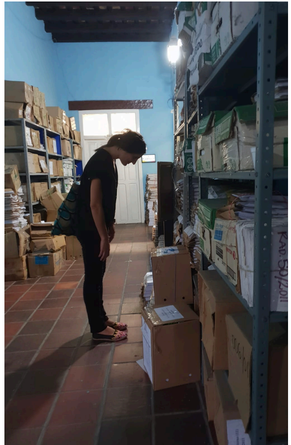
Delegate observing confidential case files stored in the corridors of Courts of El Cartel Fijo , accessible to the general public, Cartagena

The Caravana heard, during their meeting with the Asonal Judicial , that since 1974, the building has undergone numerous repairs highlighting concerns with the lifts and yet the conditions in the court building have continued to be unsafe for lawyers and judges to work in. The lifts had allegedly been faulty for years with more than thirty incidents reported since 2014 that authorities have failed to resolve; the ongoing delay in identifying an alternative court building gives the impression that ensuring a functioning court process is not a high priority to the authorities. As a result, the judges have gone on strike bringing access to justice to a halt.