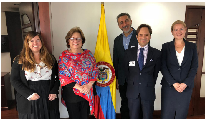
Delegates meet the Minister of Justice, Gloria María Borrero Restrepo

Delegates met with several judges in Cartagena who explained that land restitution judges face significant risk and thus have bodyguards by default. In Cali, many of the lawyers and judges with whom the Caravana met reported having been threatened as a result of their work, with some judges alleging that their communications are tapped and monitored.