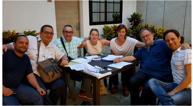
Delegates meeting regional hosts in Medellín

In Cali, delegates heard of the struggle lawyers face to develop an overarching membership body, akin to a Law Society or Bar Association, to dignify the profession, increase solidarity among lawyers, and introduce a Code of Ethics to ensure lawyers are not unjustly associated with clients. It was felt that this structural improvement could help deal with aspects of corruption in the legal system.