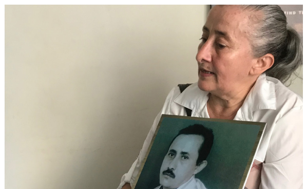
Family member of victim of 'false positive' killings with photo of their loved one.

The Caravana met with family members who have waited years for justice for the extra-judicial execution of