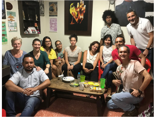
Delegates with the EJP team in their office in Bucaramanga