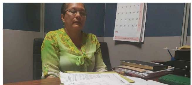
Victim of forced displacement swamped in paperwork, Cartagena

The Caravana met with a farmer who had been forcibly displaced from Montes de María with her husband, unable to return to their land. She explained that they used to own a rich land and had a prosperous future but now they are homeless in Cartagena. She showed the various documents she had filed to claim compensation as a victim and seemed confused by the lengthy and complicated process she had to go through to be recognised as a victim and to be able to receive compensation from the state. Even though she has a lawyer, she was uncertain of which stage of the process she has reached and her case, showing how the system presents many difficulties for victims.