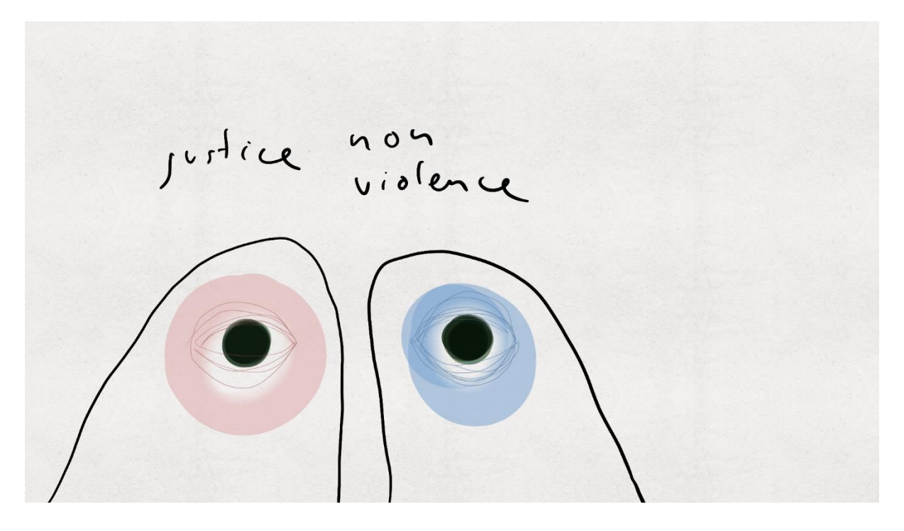
*Still image from Reactive Courage: justice - nonviolence