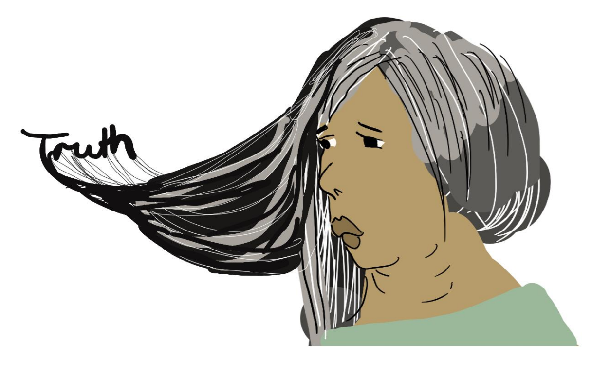
*Still image from Reactive Courage: truth